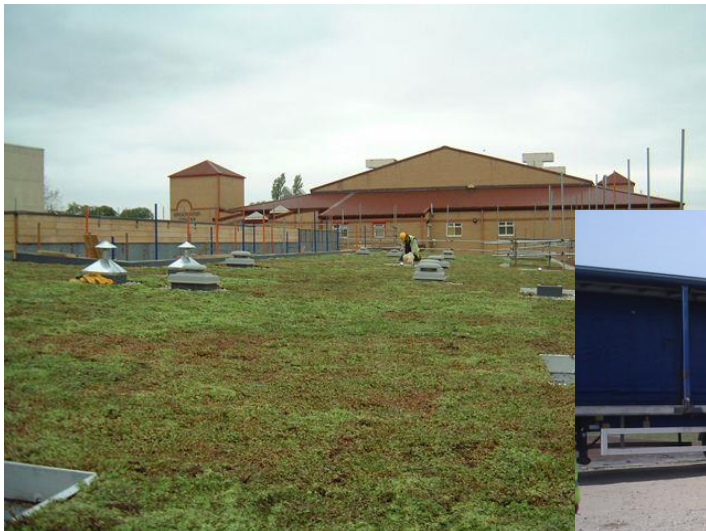
Newly installed NatureMat