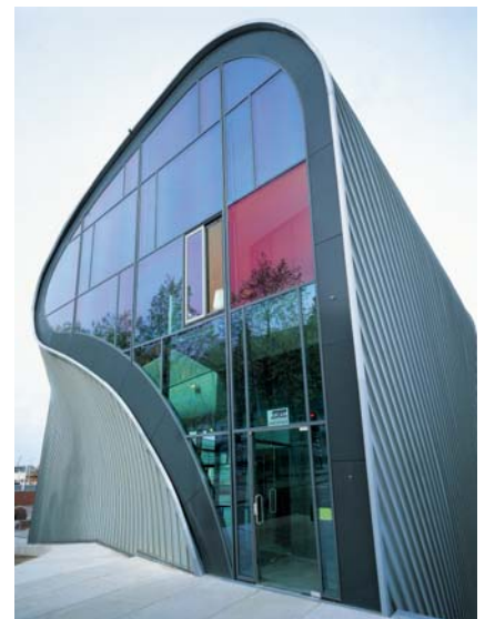
Project: Amsterdam Architecture Centre (ARCAM), The Netherlands Architect: René van Zuuk