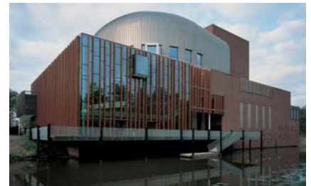
Project: Spiegel Theatre, The Netherlands Architect: Greiner van Goor Architects