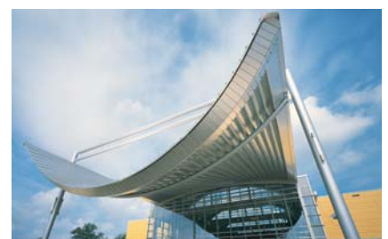
Project: Emmen Hospital, The Netherlands Architect: A/d Amstel Architects