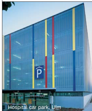
Hospital car park, Ulm