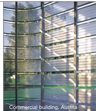
Commercial building, Austria