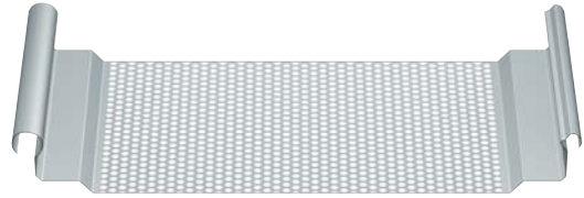
Kalzip AF 65/434P