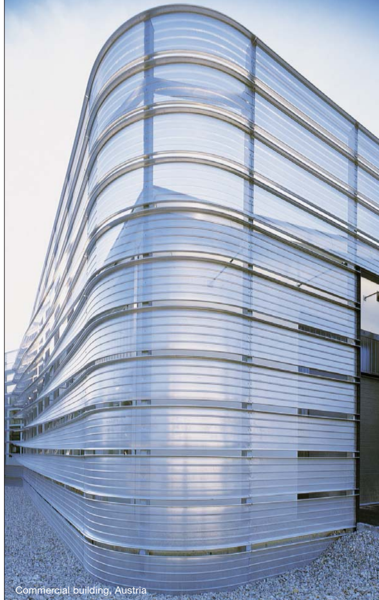
Commercial building, Austria

As Kalzip only permits its systems to be installed by its approved Teamkal Network, the quality of installation can also be assured so that product performance is never compromised.