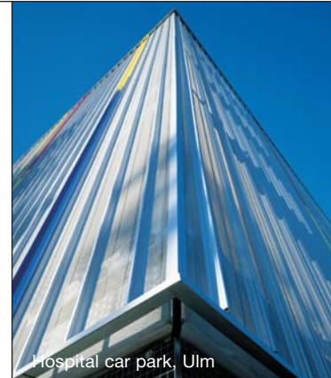
Hospital car park, Ulm