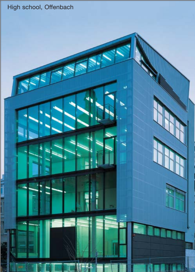
High school, Offenbach