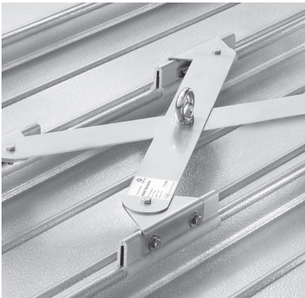
Kalzip® roof anchor