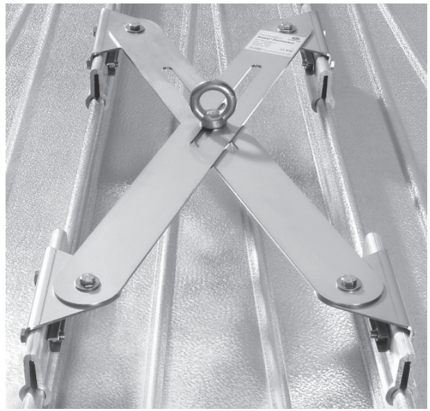
Kalzip® tapered roof anchor